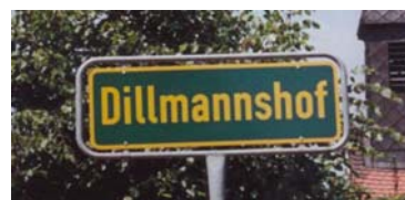
Sign in Illingen, Germany

With your membership in the DFA, you will receive the next 7 newsletters. Membership is only $10.00 per immediate family for the next two years (See details on the last page).