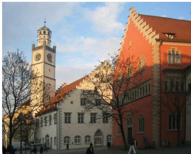
Ravensburg Town Hall.

Ravensburg lies 13 miles north of Lake Constance, where the borders of Germany, Switzerland and Austria meet. We will have the opportunity to visit these on Day 11 of the itinerary. We will be hosting our 3 rd Dillmann family dinner with local Dillmanns in Ravensburg, with the goal of attracting those Dillmanns in southern Germany as well as those living in Switzerland. Some German researchers believe that the Neureut Dillmanns (family Group 2) originally came from Switzerland. Ravensburg is a town of 48,500 within the state of Baden-Wurttemberg which has a very well preserved old town area with 3 gates and 10 original towers still intact from the medieval fortifications. Ravensburg is in the area of Southern Germany that once formed part of Swabia where the local German dialect is called Swabisch, which even though it is rather musical is quite incomprehensible to other German speakers.