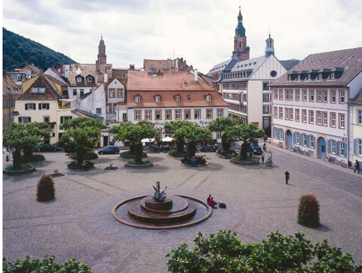
Old Town main square, Heidelberg