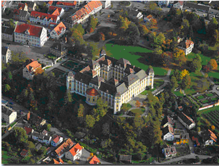
Ravensburg from the air

Ravensburg was first mentioned in records in 1088. It was founded by the Welf family, who were rivals to the Hohenstaufen family for control of German territory and election as Holy Roman Emperors in the early Middle Ages. Within 100 years, Ravensburg and its castle came into the hands of the Hohenstaufens. Shortly after the family became extinct in 1268, Ravensburg became an Imperial Free City, meaning it came under the direct control of the Holy Roman Emperor. As order was restored, Ravensburg became a major trading centre for linen and later on, paper as well. Sadly, Ravensburg suffered, like much of Germany, during the Thirty Years War when the Swedish army destroyed Ravensburg Castle and the flourishing economy stagnated. In 1810, the city was incorporated into the Kingdom of Wurttemberg as part of the reorganization of Europe during the Napoleonic era. The Kingdom continued in existence until the end of first World War. The absence of new building since the Thirty Years War has been a blessing as the old town has been faithfully conserved and preserved as it was.