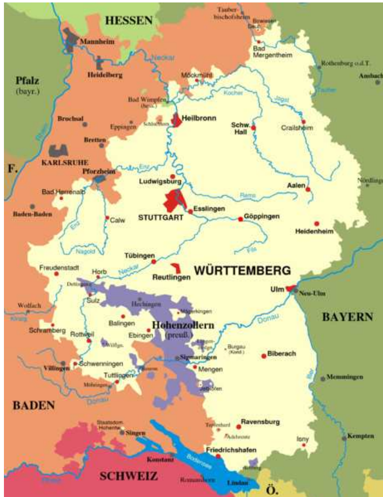
Southern Germany c. 1810 (F. = France, Schweiz = Switzerland, Bayern = Bavaria, Ö = Austria)