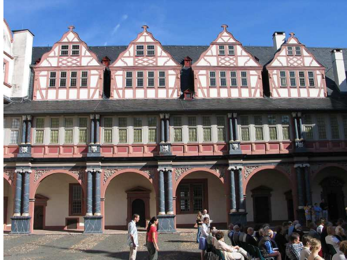
Courtyard of Weilburg Castle

Weilburg was first mentioned in records in 906 and in 912. Conrad I, King of East Francia, the elected successor of the Carolingian emperors, founded a church and abbey here. Weilburg was strategically situated and controlled trade between Frankfurt and Cologne. Weilburg's Evangelical church contains the official burial vaults for the House of Nassau during the time of their pre-eminence from 1355 until 1816 when Hesse became a Prussian duchy.